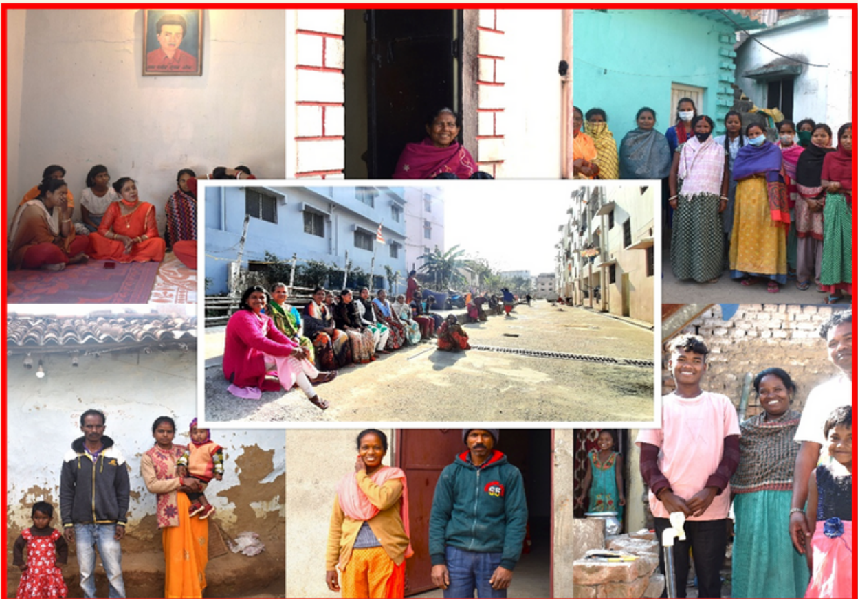
SNAPSHOT OF RESEARCH WORK UNDERTAKEN FOR MHT IN RANCHI DISTRICT