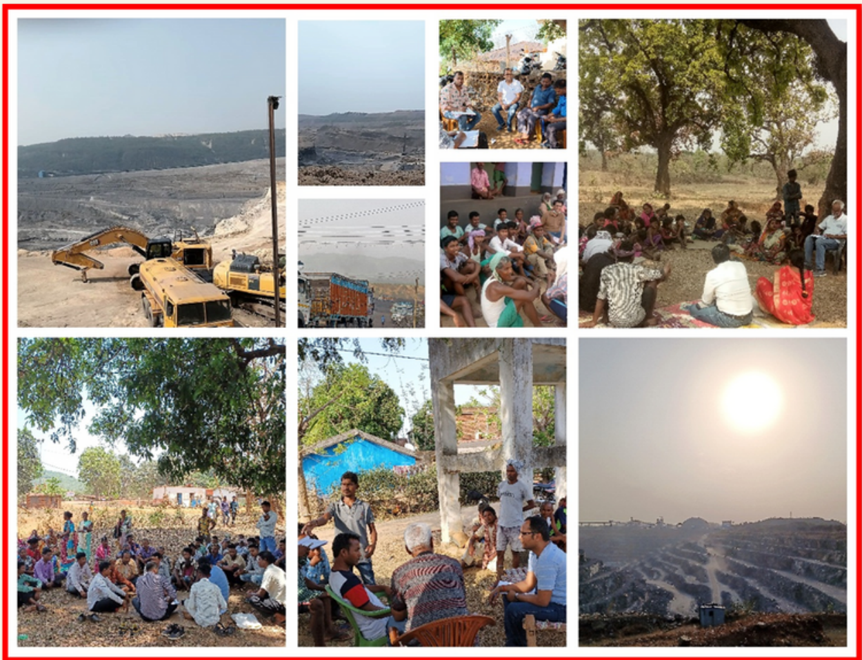
Snapshot of research work undertaken in DMFT, covering 40 mining affected villages of Jharkhand and Odisha State.