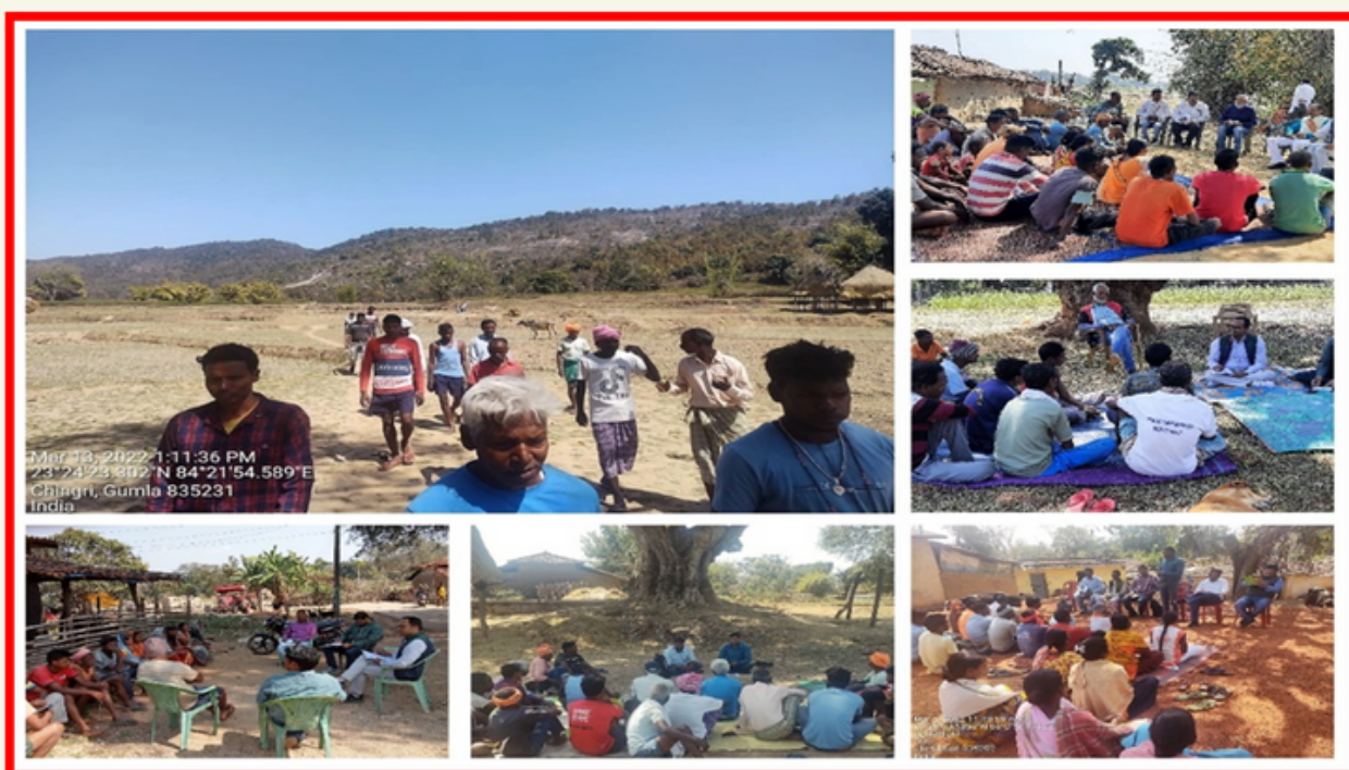
Snapshot of DPR preparation work undertaken in VDP covered in 15 villages of Ranchi, Gumla & Surajpur district